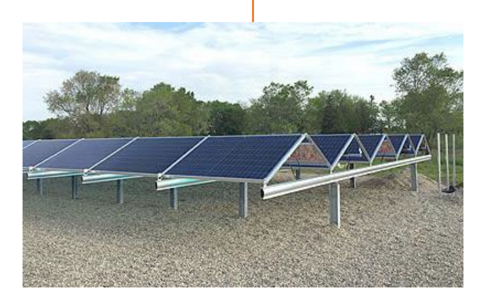
Runestone Electric Association 44 KW Community Solar Alexandria, Minnesota

Interconnection process for distributed energy resources less than 10 megawatt interconnected to the distribution system of a cooperative in the state of Minnesota.